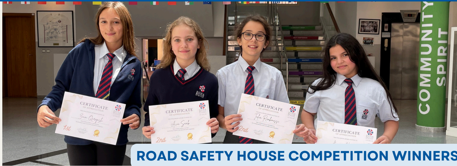
ROAD SAFETY HOUSE COMPETITION WINNERS