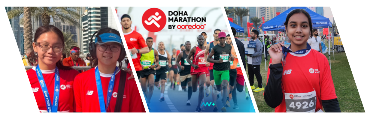
Celebrating Resilience, Motivation, and Community Spirit

Friday 17th January saw the return of the Ooredoo Doha Marathon where the whole of the Corniche appeared to turn into a sea of red Oordeoo t shirts as thousands of runners completed their events.