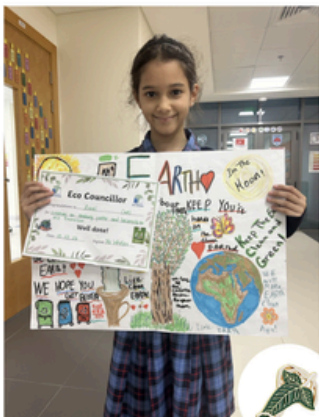
Amal Eco Council