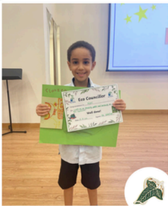
Anas Eco Council