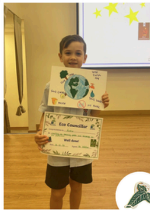
Austin Eco Council