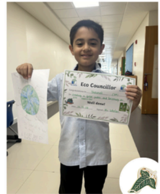
Shaunak Eco Council