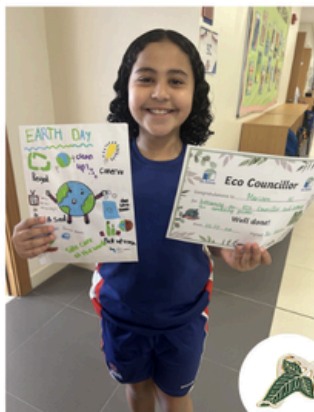
Mariam Eco Council