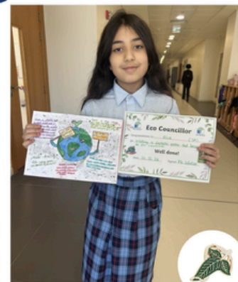
Alia Eco Council